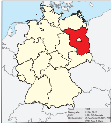
Geographical position of the state of Brandenburg in Germany

The state of Brandenburg is the fifth largest federal state and is located in the north-east of Germany.